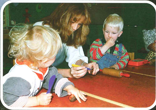
Design: HITRA•FRØYA Lokalavis AS.