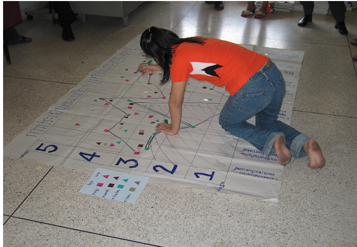
Something to Learn. Something to share. Building the river diagram in Chiang Mai, Thailand

Most importantly, our priority has not been simply to produce facilitators and coaches who are able to deliver the AIDS Competence process as a process. Rather, our concern has been to ensure that they can deliver our process in a way that is consistent with the way in which we seek to work with communities. We characterise this way of working and way of thinking by the acronym SALT. The S stands for Stimulate, A for Appreciate, L for Listen, Learn and Link, and T stands for Transfer and Team. SALT is the mode of interaction with communities, and is practiced in each step of the process. The initial part of the program introduces this approach in considerable details. But in addition, in each of the modules where the students look at each step in the AIDS Competence process there is a 'digression' that explores our approach in a different, sometimes less serious ways.