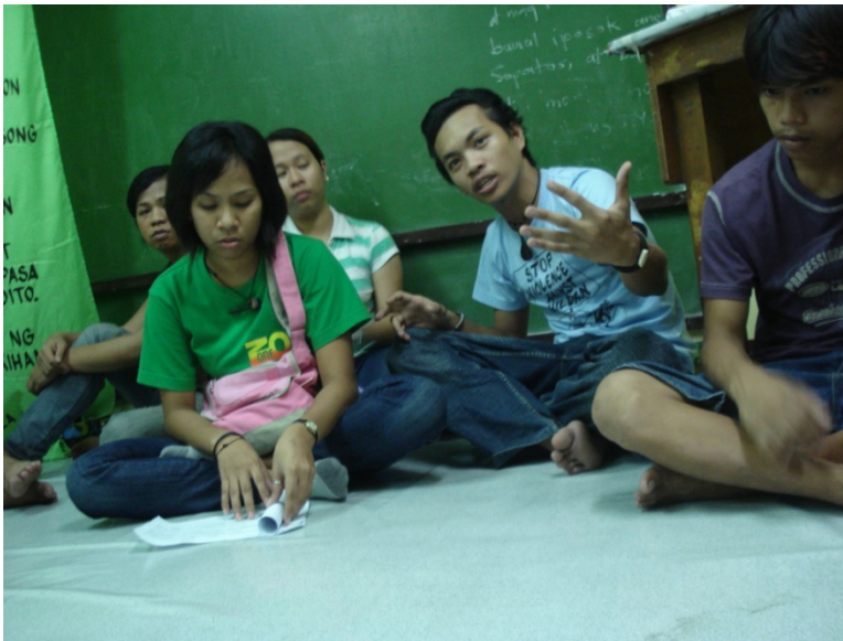
ACP Learning event, the Philippines.

The role of the Blended Learning program in the work of the Constellation has evolved during its development. This evolution will be discussed in detail in the report, but the Constellation now sees a broader role for Blended Learning in its business plan than was originally envisaged.