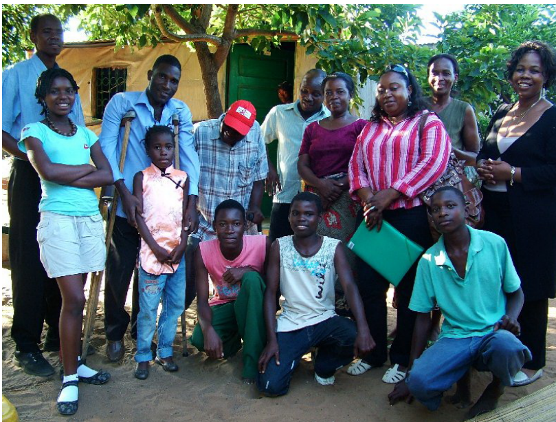
SALT team visiting a home in Mozambique

During the project, we have noticed that organizations that work with the AIDS Competence methodology change their internal ways of working. Thus, the process not only leads to competence in dealing with the particular problem of HIV/AIDS, but also impacts the organisation in a much broader fashion. This process of change has not been highlighted in the current version of Blended Learning.