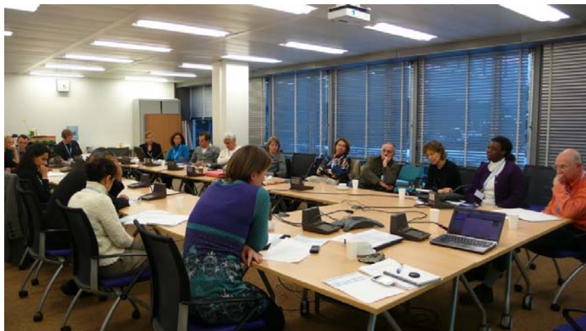
Final workshop in Geneva, 12-13 January 2010