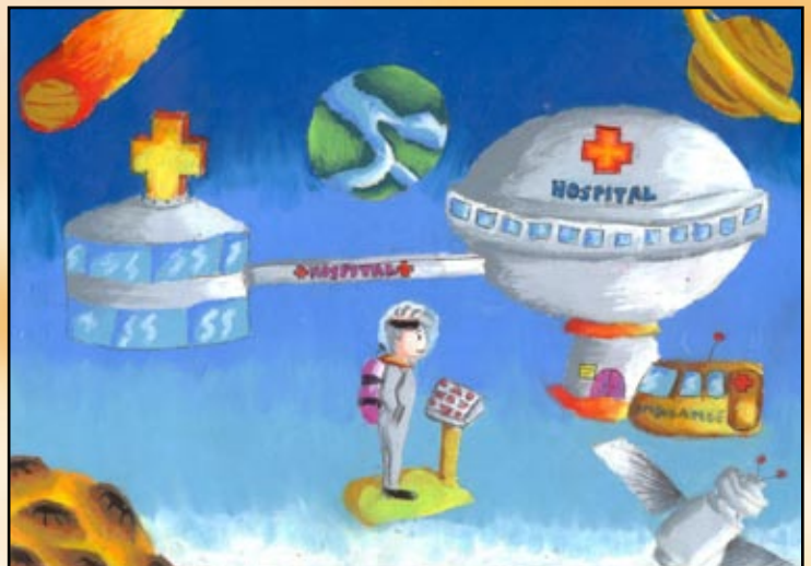
Drawing: Sherlie Octaviani

The tutorials are not included in the conference fee.