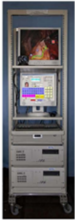
DiViSy DOR Pro for operation theaters

The latest trend in the development of modern medicine is to establish DiViSy DOR - Digital Operation Room. These represent an integrated solution that brings together various medical equipment and all the advantages of digital medical information. Each DiViSy DOR becomes open for the exchange of various medical information in real time, and this improves the quality and financial efficiency of diagnostic processes, treatments and surgical intervention. DiViSy DOR transforming various medical information to digital form with all its advantages of processing, storage, transfer and registration. DiViSy DOR has functions of control by various medical devices and the equipment. All these intellectual capabilities of DiViSy Digital Operation Rooms are achieved through the base of DiViSy telemedicine technology and equipment. DiViSy Group has been developing and producing digital medical systems for over ten years jointly with leading physician-experts in various fields of medicine.