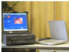
DiViSy DOR Mobile

The latest trend in the development of modern medicine is to establish DiViSy DOR - Digital Operation Room. These represent an integrated solution that brings together various medical equipment and all the advantages of digital medical information. Each DiViSy DOR becomes open for the exchange of various medical information in real time, and this improves the quality and financial efficiency of diagnostic processes, treatments and surgical intervention. DiViSy DOR transforming various medical information to digital form with all its advantages of processing, storage, transfer and registration. DiViSy DOR has functions of control by various medical devices and the equipment. All these intellectual capabilities of DiViSy Digital Operation Rooms are achieved through the base of DiViSy telemedicine technology and equipment. DiViSy Group has been developing and producing digital medical systems for over ten years jointly with leading physician-experts in various fields of medicine.