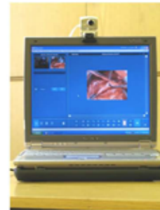
DiViSy DOR Personal for physician-experts

DiViSy Group, www.divisy.com , e-mail: info@divisy.com , support@divisy.com