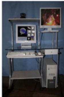
DiViSy DOR D for diagnostic rooms